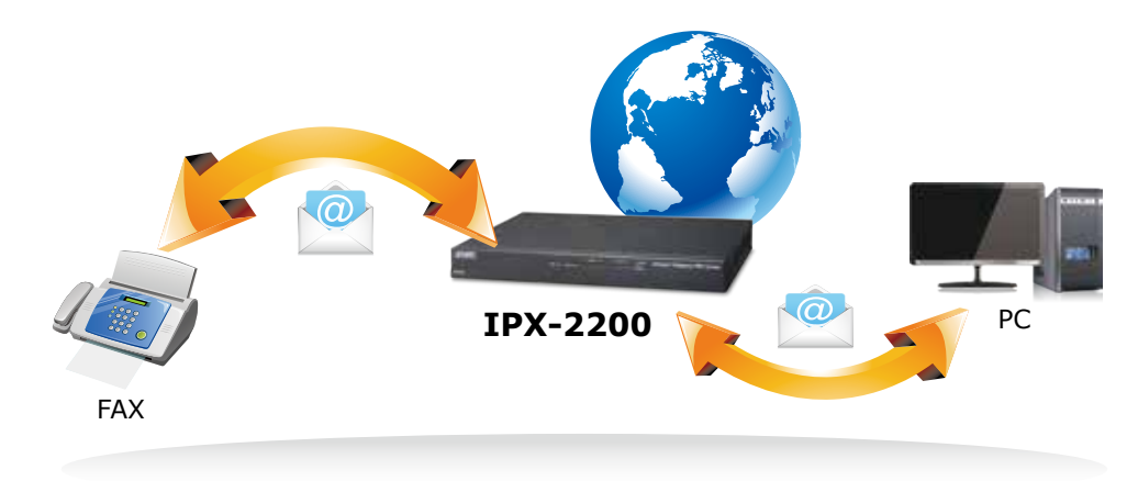
Green Office (Fax to Email / One-touch to send fax)

Virtual fax functionality on IPX-2200 system allows faxes to be sent and received without requiring a fax machine. This useful feature will allow businesses to demonstrate their green credentials while at the same time reduce fax related costs across the enterprise. Inbound faxes can be automatically received and converted to TIF files and saved in the IPX-2200 system. It is also possible to configure the IPX-2200 system to send the TIF files to a user's email box. Sending outbound faxes is as easy as uploading a file from the extension user web portal, thus creating a paperless or green office.