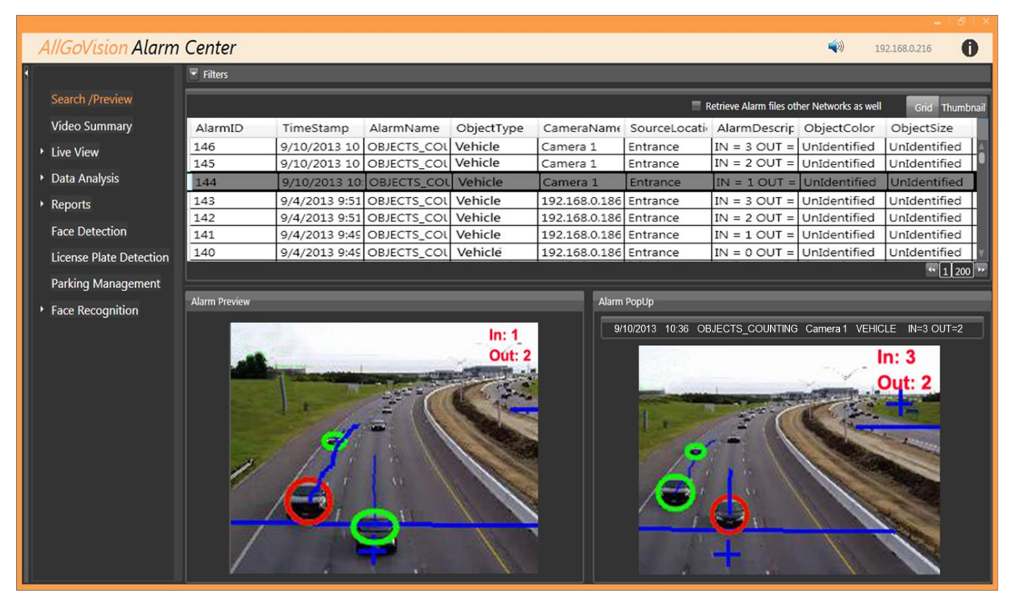
Vehicle Counting Alarms in Alarm Center