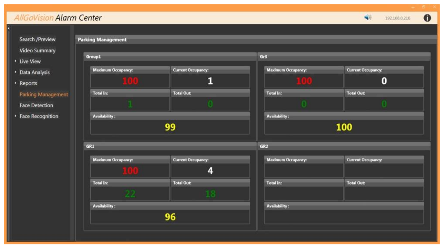
Parking Availability in Alarm Center